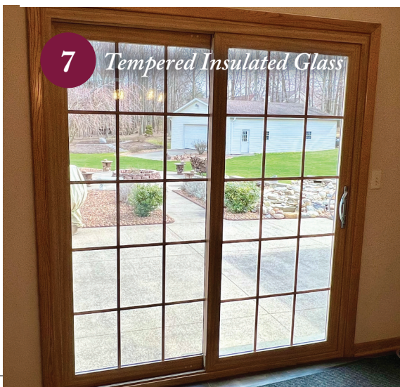
7 Tempered Insulated Glass