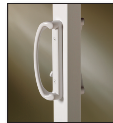
White, Black, or Beige Coated

Each Prima Vista patio door contains "Nucleus technology," an eco-efficient PVC core designed to maximize material efficiencies and performance. We have worked together with our supplier partners for decades to reduce waste, optimize energy and water consumption, and reduce the impact of transportation. The NUCLEUS technology in our Prima Vista patio door is a part of those efforts and represents nearly a decade of hard work and investment.