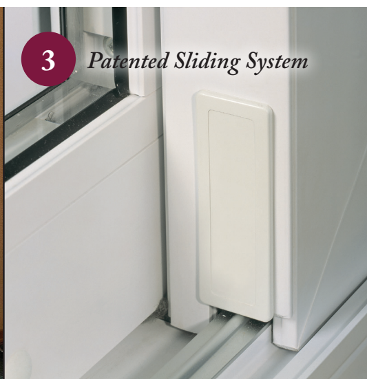
3 Patented Sliding System