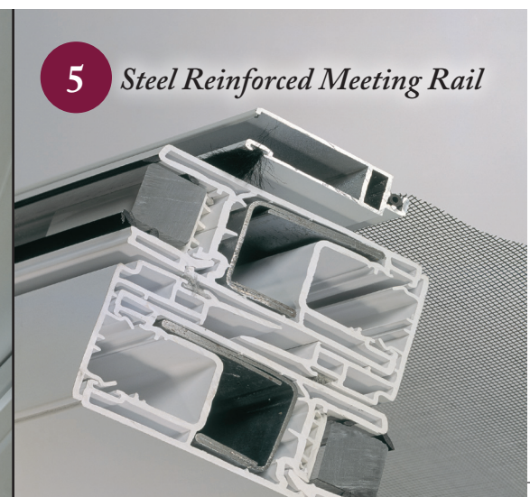
5 Steel Reinforced Meeting Rail